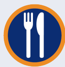
Meal ID Solution